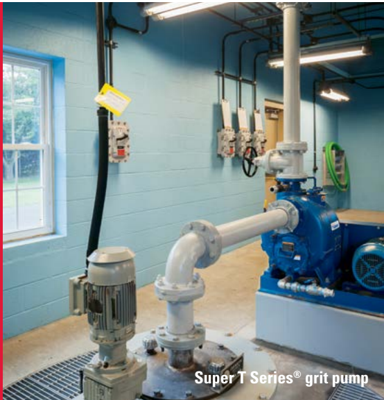
Super T Series® grit pump