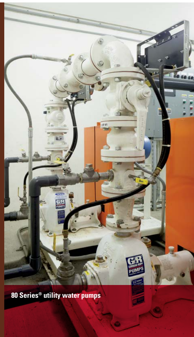
80 Series® utility water pumps

NOTE: Gorman-Rupp recognizes that the above treatment plant diagram will not apply for all municipalities and is meant for illustrative purposes only.